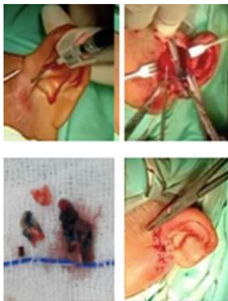
Figure 2. Surgery procedural.

excision, interrupted suturing was performed along the incision with 8 sutures of Polyglycolic Acid (PGA) 5.0. The patient was given an initial systemic antibiotic.