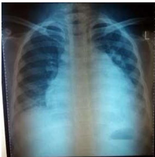
Figure 1. X-ray imaging posteroanterior.

From the initial investigations that have been carried out, the complete blood count and blood chemistry checks showed a hemoglobin level of 8.6 g/dL (standard 12.0-15.0 g/dL), hematocrit level 31.8% (standard 35-49%), MCV 66. fL, MCH 17.9 pg, MCHC 27.0 g/dL (microcytic hypochromic anemia) and albumin 2.7g/dL (hypoalbuminemia). Massive cardiomegaly and signs of congestive heart failure were found (Figure 1).